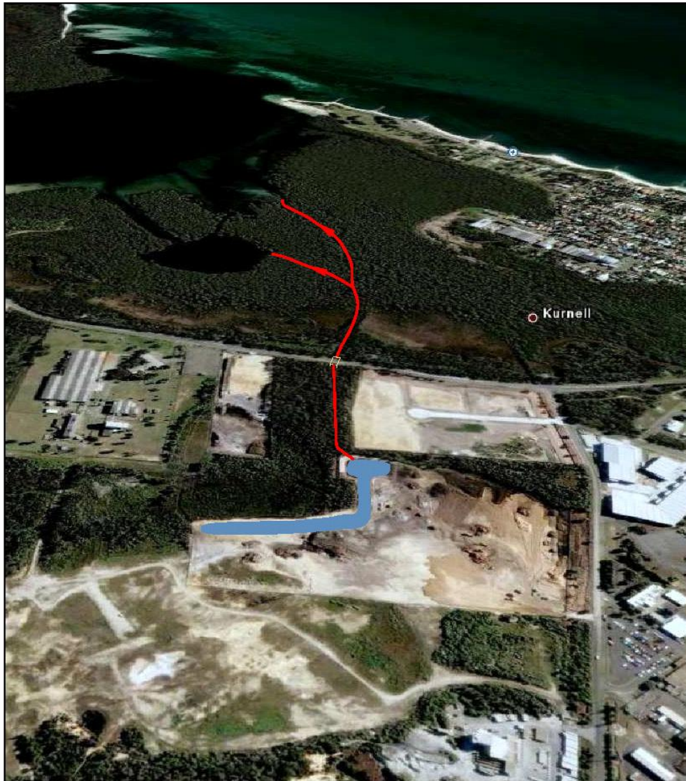
Figure 3 Offsite Flows from Retention Basin

→ Offsite flow from retention basin (runs into an existing open channel in the Conservation Area, and is then conveyed through the existing open channel under Captain Cook Drive which connects into Quibray Bay).